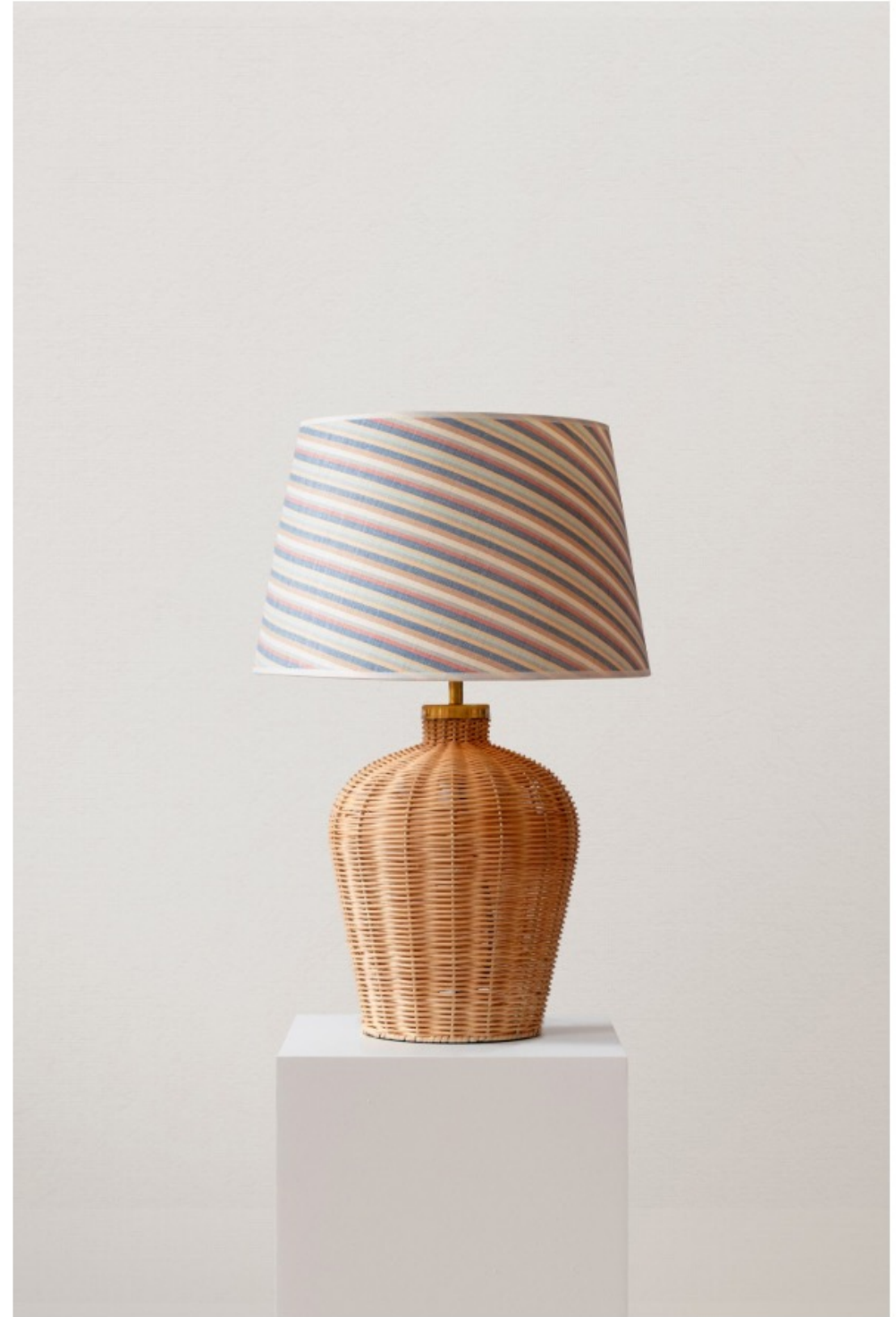
Burton Striped Horsehair French Drum Lampshade - Blue Multi Stripe

The designing of the collection coincided with the renovation of Kate's house on the Île de Ré, a place where she has spent many happy summers bicycling to the market or to the beach across the salt marshes. The island's chalky light, muted timber tones and weathered shutters subtly informed the palette. Horsehair as a material carries inherent structure and formality, so the challenge was to introduce freshness and lively movement through colour without losing its integrity.