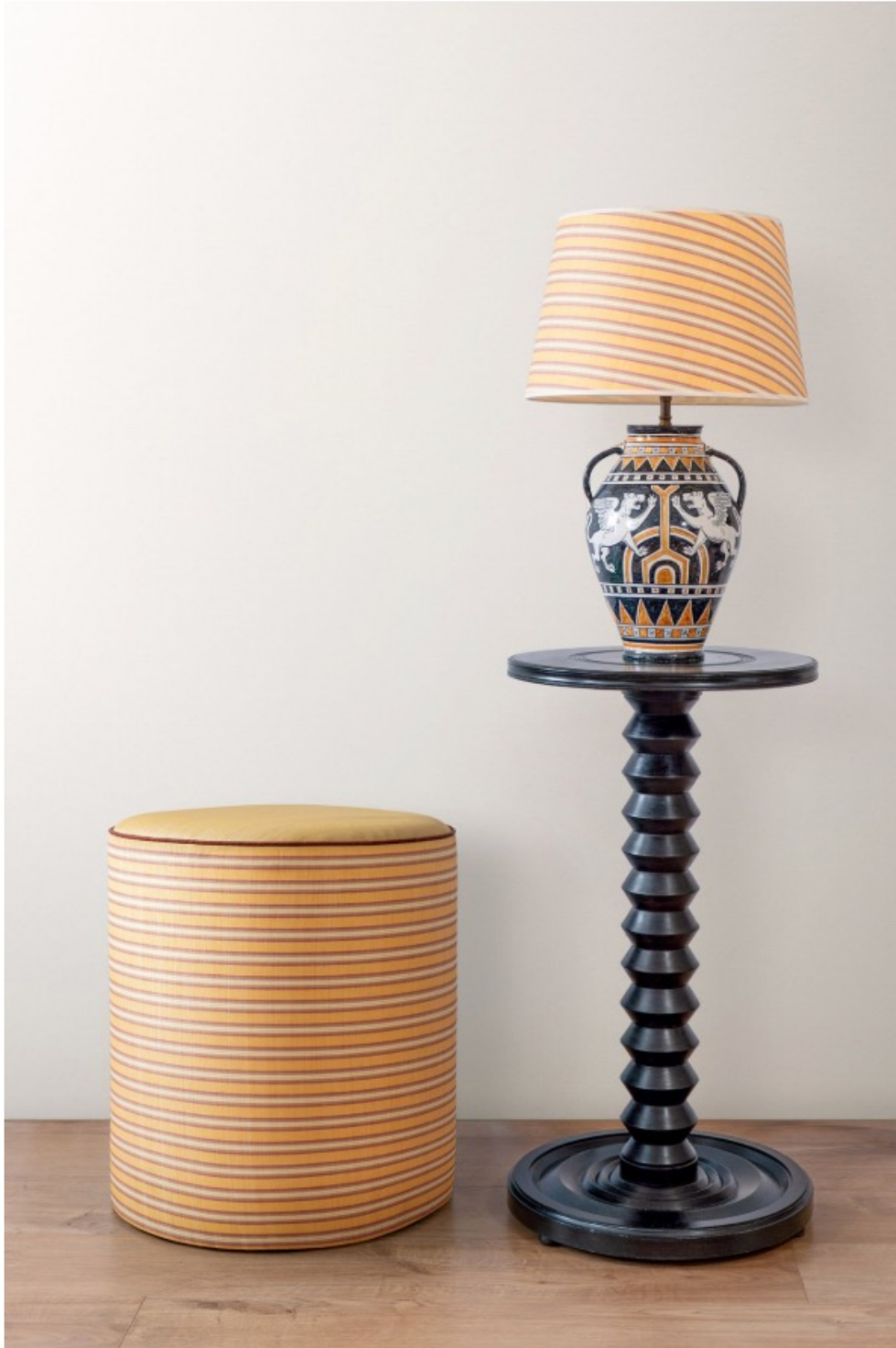
Flynn Striped Horsehair Upholstered Drum Stool - Yellow & Red, Burton Striped Horsehair French Drum Lampshade - Yellow & Red