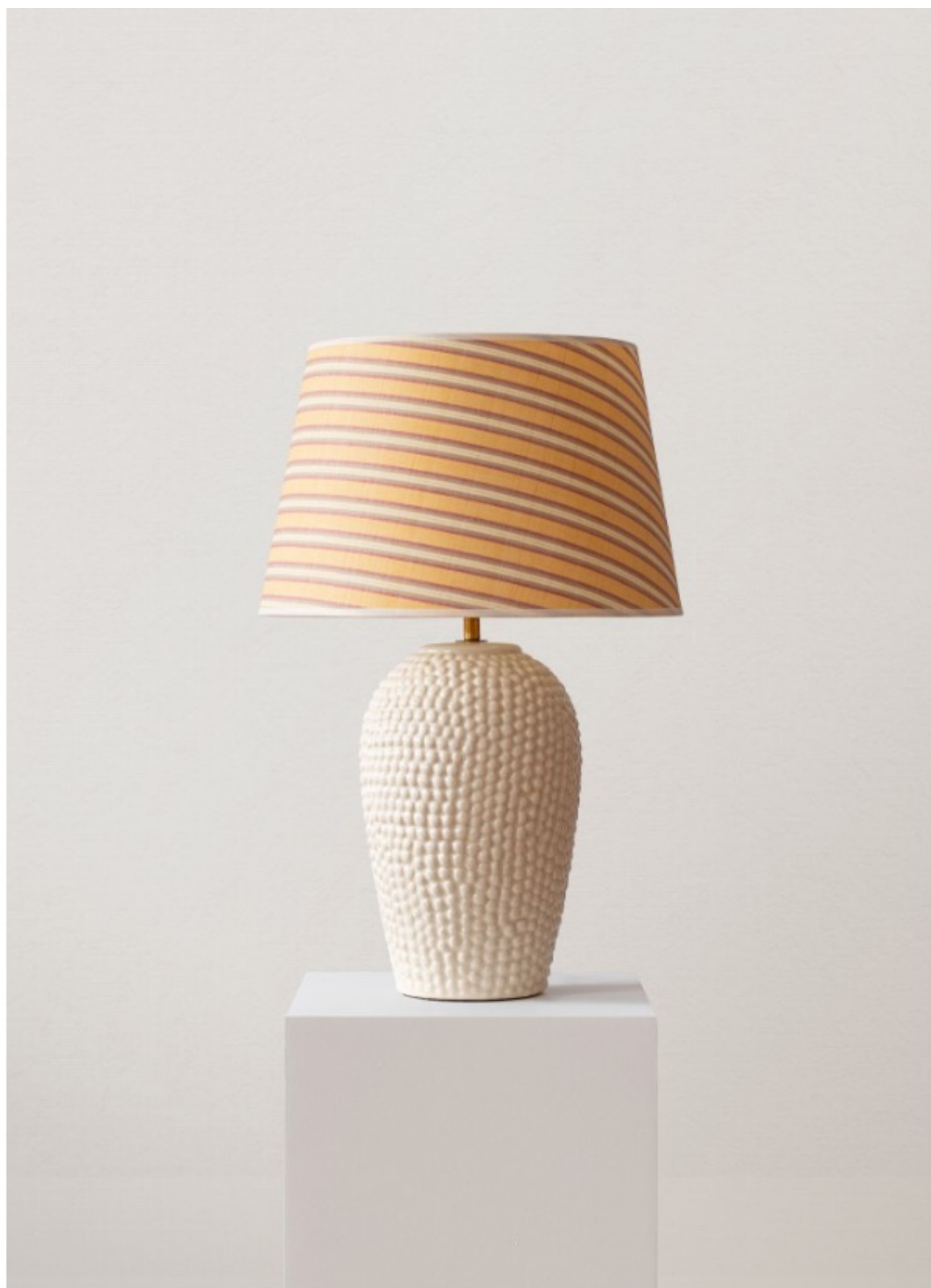
Burton Striped Horsehair French Drum Lampshade - Yellow & Red