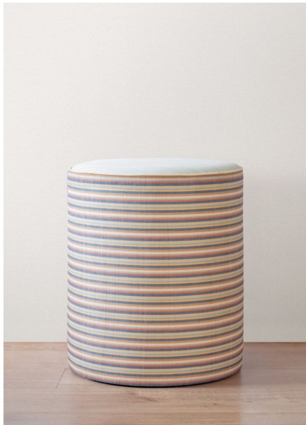
Flynn Striped Horsehair Upholstered Drum Stool - Blue Multi Stripe

John Boyd Textiles has been weaving horsehair in Castle Cary since 1837, using original looms and traditional techniques dating back to 1870. Each fabric is crafted from the finest horse tail hair combined with cotton or silk warps, delivering exceptional durability, natural fire resistance and acoustic properties. With its deep heritage, it feels surprisingly fresh for today.