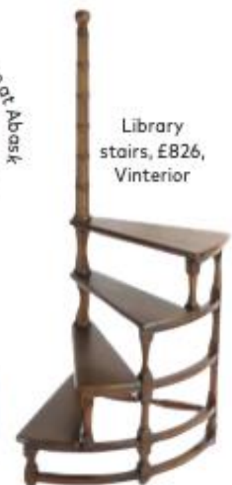
Library stairs, £826, Vinterior