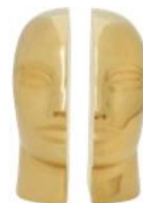
Bookends, £395, Jonathan Adler