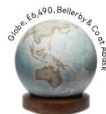
Globe, £6,490, Bellerby & Co at Abask