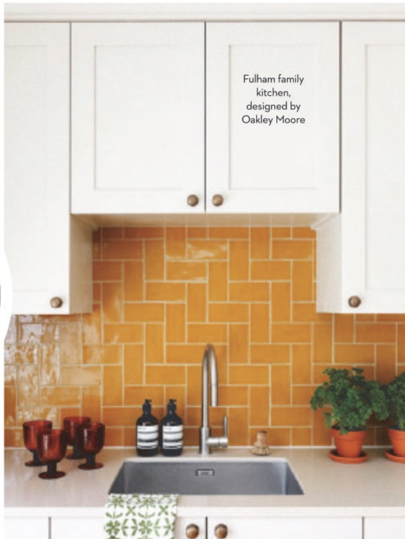
Fulham family kitchen, designed by Oakley Moore