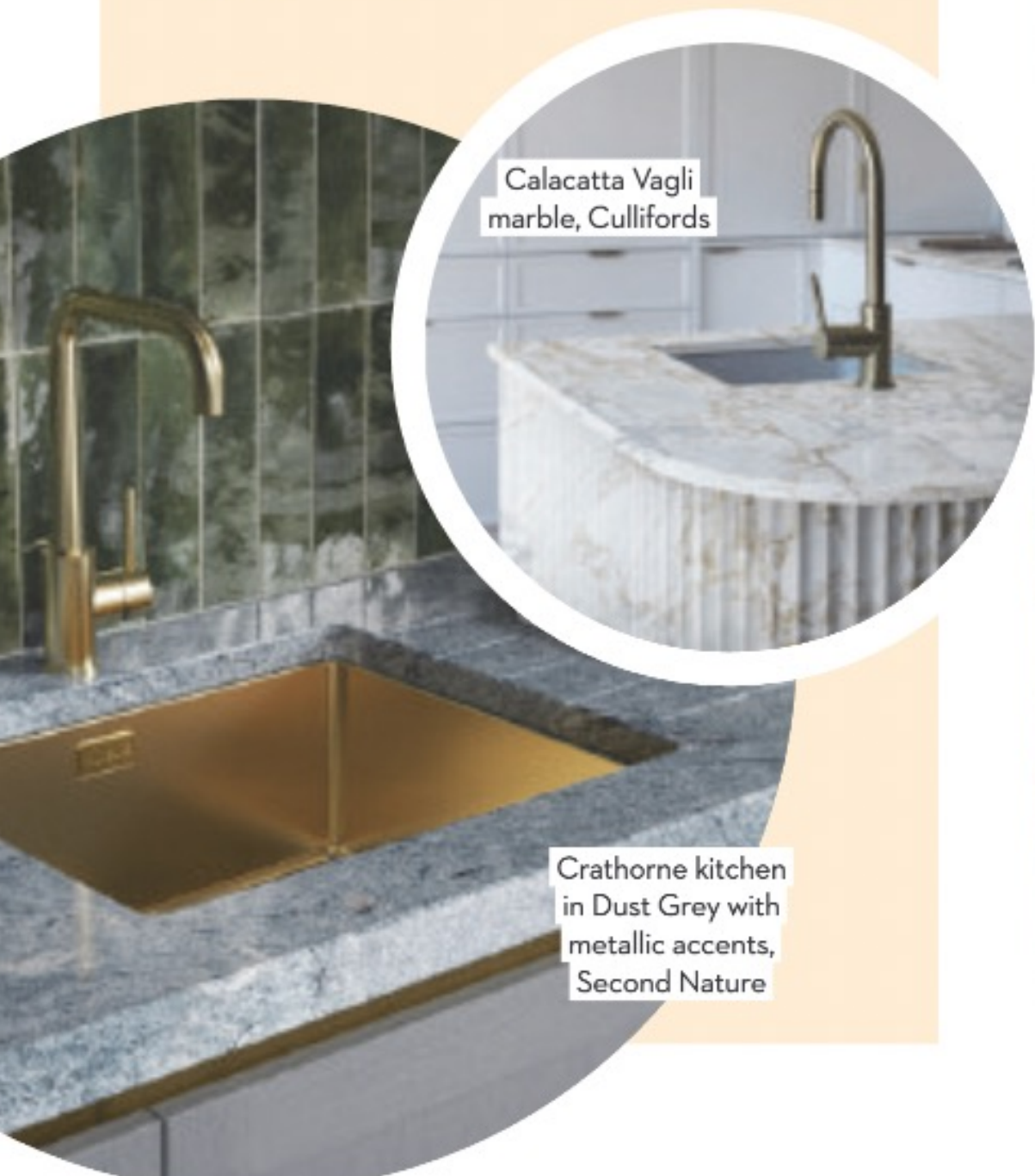
Calacatta Vagli marble, Cullifords