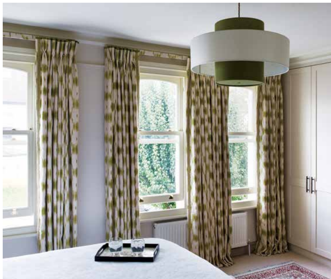
above Elegant green Blithfield curtains add pattern to the otherwise pared-back main bedroom. The matching light is bespoke by Copper & Silk using Romo fabric and the bespoke cupboards by Richard Cullinan Joinery run the length of one bedroom wall to ensure all clutter is neatly hidden away. The bed is by Hynnos and the bedding Gilly Nicolson.