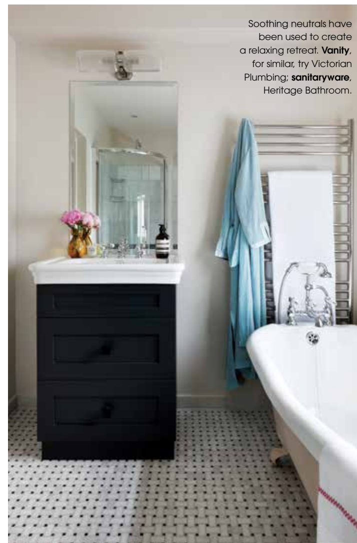
Soothing neutrals have been used to create a relaxing retreat. Vanity , for similar, try Victorian Plumbing; sanitaryware , Heritage Bathroom.