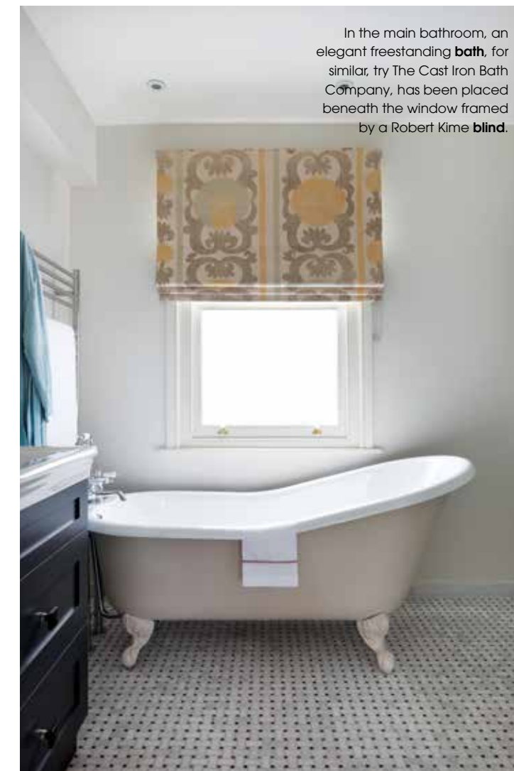
In the main bathroom, an elegant freestanding bath , for similar, try The Cast Iron Bath Company, has been placed beneath the window framed by a Robert Kime blind .